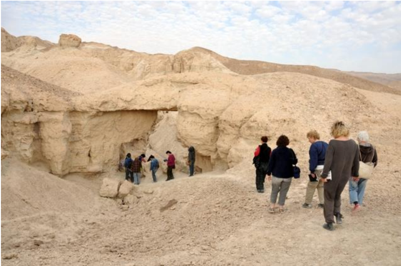
Ceramics workshop at Neot Hakikar, Dead Sea, Israel