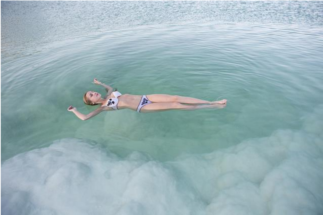
Dead Sea, Israel